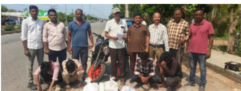
Skyline Correspondent Bhadradi kothagudem : JUNE - 05 Excise Enforcement officials seized 4.48 kg of dry ganja being transported on two motorcycles during a vehicle inspection near kesavapuram in Palvancha. The operation was conducted