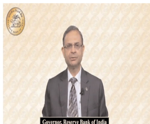
Governor, Reserve Bank of India

Announcing the outcome of the MPC meeting, RBI Governor Sanjay Malhotra said all members voted in favour of maintaining the policy repo rate under the Liquidity Adjustment Facility (LAF) at 5.25 per cent. As a result, the Standing Deposit Facility (SDF) rate remains at 5 per cent, while the Marginal Standing Facility (MSF) rate and the Bank Rate continue at 5.5 per cent. Global uncertainties remain a key concern Explaining the committee's thinking, Malhotra said the global economy continues to face multiple headwinds, including supply chain disruptions, uncertainty around trade flows and heightened market volatility. "The global economy has been