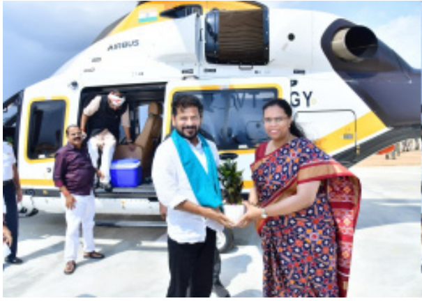
Skyline Correspondent Mahabubnagar: JUNE-05 Chief Minister A. Revanth Reddy on Friday inspected the Karvena Package-14 and Package-15 Reservoirs located in Bhootpur Mandal of Mahabubnagar District. These reservoirs are being

constructed as part of the Palamuru-Rangareddy Lift Irrigation Scheme. "During the inspection, the Chief Minister asked irrigation officials about the extent of pending works. The Irrigation Chief Engineer informed him that works