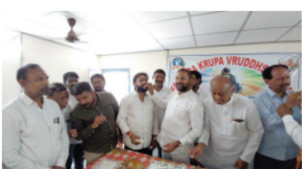
Skyline Correspondent Peddapalli : JUNE -

05 Koleti's birthday celebrations were held