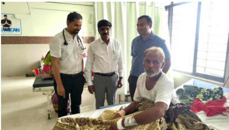
Skyline Correspondent NIZAMABAD : JUNE - 05 The Department of Cardiology at the Government General Hospital (GGH), Nizamabad, has achieved a