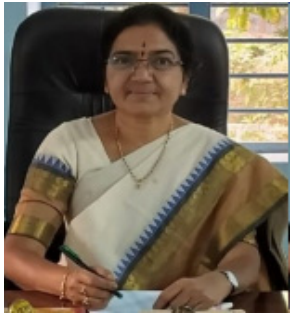
Skyline Correspondent Bhadradi kothagudem : JUNE - 05 As per the directives of the Telangana Gov-