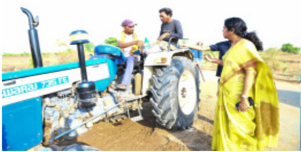
Skyline Correspondent Kumaram Bheem Asifabad : JUNE - 05 District Collec-