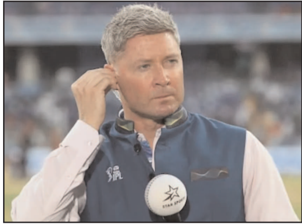
safely," Clarke said on the Beyond23 Cricket Podcast.

Former Australia captain Michael Clarke has revealed he narrowly escaped a potentially devastating road accident while travelling to the airport after the IPL 2026 final in Ahmedabad, describing the incident as one of the most frightening experiences of his life. Clarke, who was in India as part of the tournament's commentary team, said he was asleep in the passenger seat when the vehicle crashed into the back of a semi-trailer, leaving the front portion of the car lodged underneath the truck.