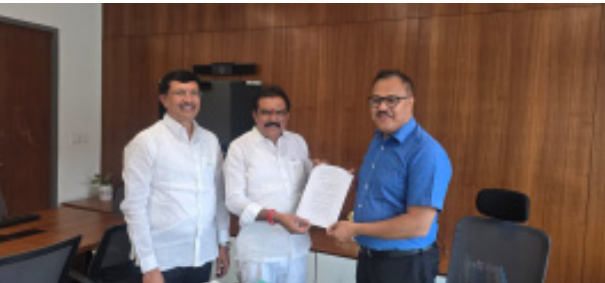
Skyline Correspondent Adilabad: JUNE-05 A major step has been taken towards the construction of another prestigious and one of the largest airports in Telangana after the Shamshabad International Airport. The Central and

State Governments are actively working on establishing a Joint Airfield Airport in Adilabad over an area of 1,980 acres under the joint supervision of the Ministry of Defence and Civil Aviation. "Apart from the existing 400 acres under the