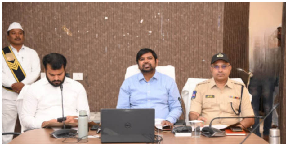
Skyline Correspondent Mancherial : April-09