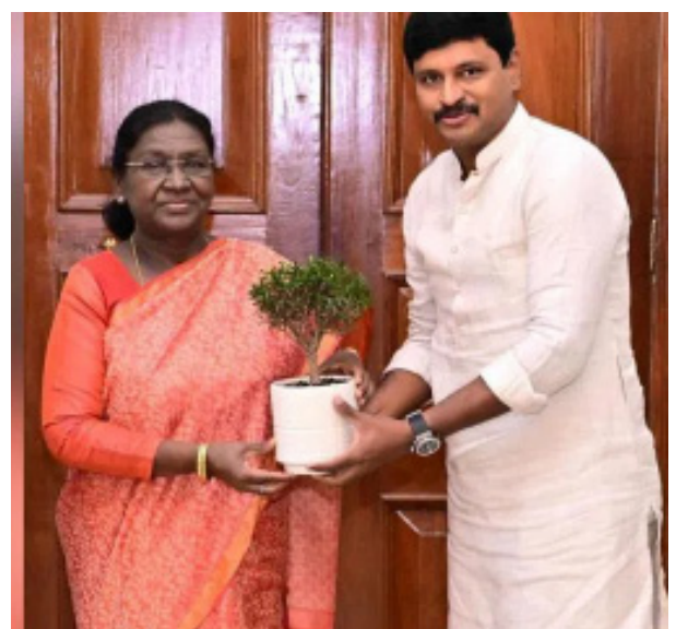
New Delhi: President Droupadi Murmu emphasised the need for a deeper spiritual connection with nature. She warned that humanity was standing