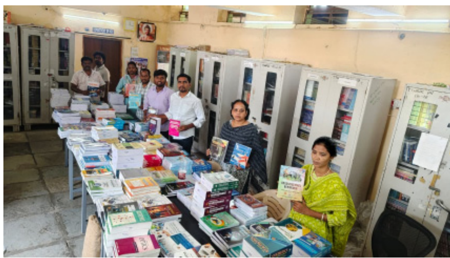
Skyline Correspondent Adilabad : April-09