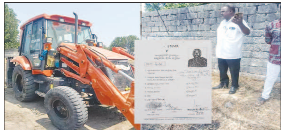
Kurnool: Apr 9

Serious allegations of corruption have surfaced against officials at the Kallur Mandal Revenue Office in Kurnool district, with claims of active involvement in illegal land dealings. Accusations indicate that certain officials, in collusion with their relatives, have facilitated land grabbing and unauthorized transactions.