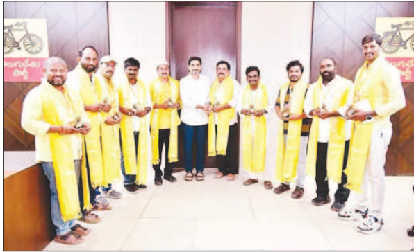
Vijayawada: Apr 9

Education and IT minister and TDP national general secretary Nara Lokesh on Wednesday expressed strong displeasure over the lack of organisational activity in recent weeks by some legislators.