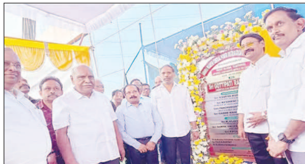
Vijayawada: Apr 9