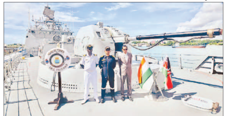
Visakhapatnam: Apr 9