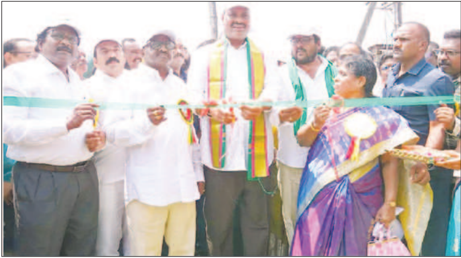
Rajamahendravaram: Apr 9

Agriculture minister K Atchannaidu called upon farmers to shift towards demand-based crop cultivation and adopt sustainable farming practices to improve incomes and protect soil health. Speaking at a Kisan Mela at the agricultural research station in Maruteru of Penmantra mandal in Achanta constituency of West Godavari district on Wednesday, the minister said organic farming offers higher returns with lower input costs while ensuring healthier food for consumers. The event focused on the theme 'Changing Climate Conditions-Sustainable Paddy Cultivation.' The minister inspected laboratories at the research station and interacted with scientists to understand the latest developments in paddy varieties.