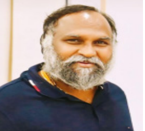
(District Correspondent / Skyline)