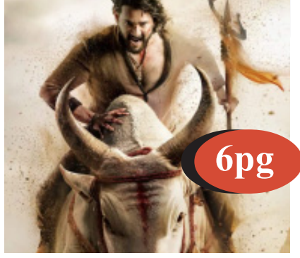
Varanasi: 1 Year to Witness History in the Making!