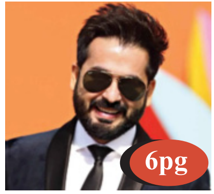
Dhurandhar Director's Next Is a Sports Drama?