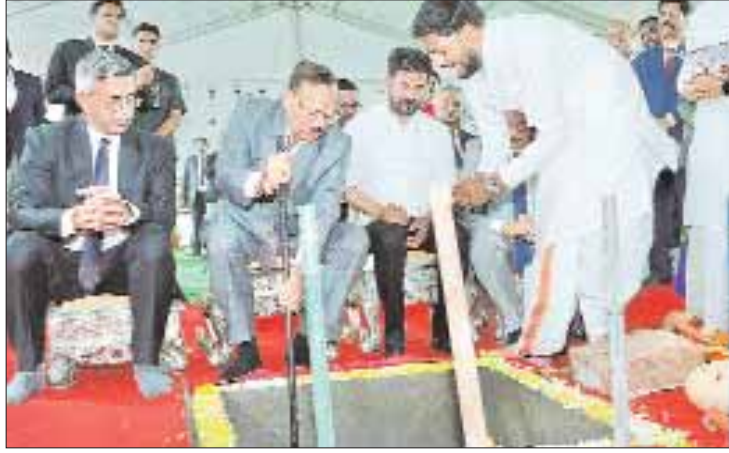
Constitution to truly come alive. He said he had the privilege of laying foundation stones for judicial court complexes in several States, including Uttar Pradesh, Andhra Pradesh, Himachal Pradesh, Assam, and now Telangana. He hoped that the proposed 100-acre new Telangana High Court

By Skyline Staff Reporter Hyderabad, April 5 Chief Justice of India, Justice Surya Kant, opined that strengthening judicial infrastructure was essential for the delivery of justice, and the State governments in the country were doing their best in this sphere. He was speaking after laying the foundation stone for Telangana High Court Zone II in Rajendernagar, on the city outskirts, on Sunday (April 5, 2026). The Zone-II includes residential buildings for judges and the chief justice.. Justice Surya Kant stressed that the judiciary and the executive must align in purpose for the