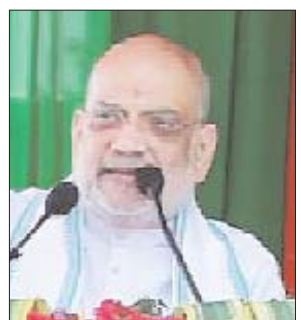
Targeting Congress, HM Shah accused the party of indulging in "vote bank politics" by supporting infiltrators. He said that past Congress governments weakened legal safeguards by scrapping the Immigrants (Expulsion from Assam) Act of 1950 and introducing the IMDT Act in 1983, which he claimed gave shelter to illegal migrants. He also criticised the Congress party for opposing the Citizenship (Contd. on pg.2)

Guwahati, April 7 : Union Home Minister Amit Shah on Tuesday launched a sharp attack on the Congress party while addressing a massive election rally in Patharkandi in Assam's Sribhumi district, asserting that only the BJP can safeguard the state from illegal infiltration and preserve its cultural identity.