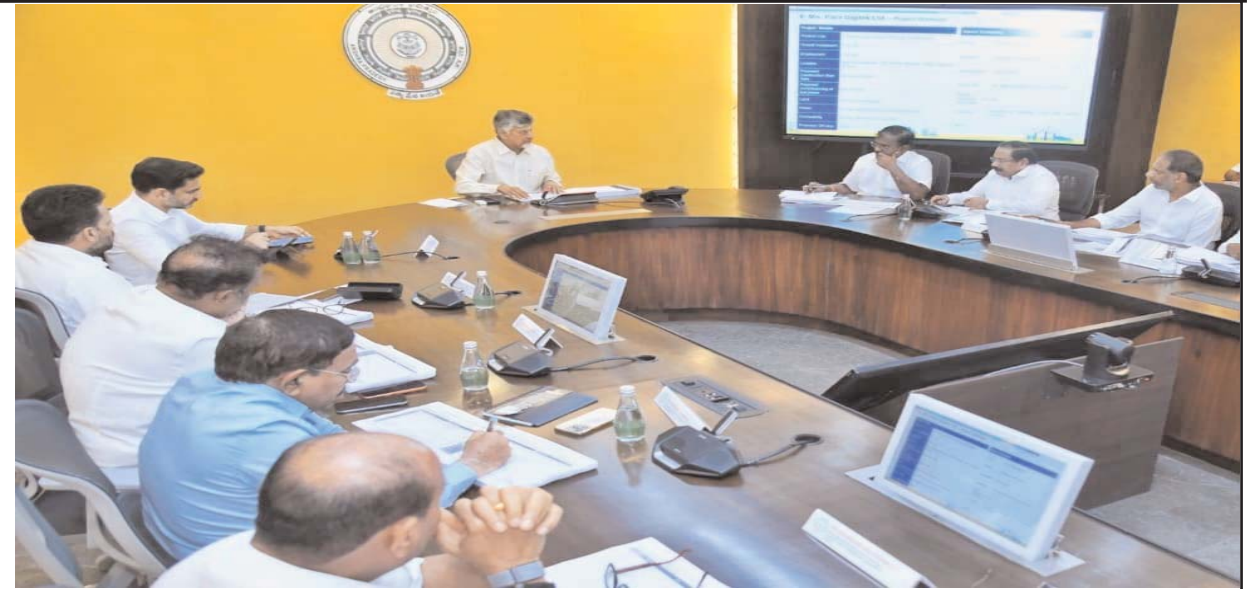
defined timelines and that investment commitments made during summits are translated into on-ground progress. With this latest round of approvals, Andhra Pradesh is reinforcing its positioning as a high-growth investment destination anchored in renewable energy, advanced manufacturing and sustainable industrialisation. (Contd. page 2)

ment is scaling up food processing capacity in line with rising horticulture output, while enhancing market linkages for crops such as palm oil and cocoa to boost farmer incomes and MSME growth.