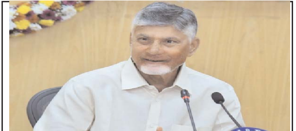
Amaravati, April 7 : Naidu said on Tuesday Andhra Pradesh Chief Minister N. Chandrababu Naidu that Prototype Fast Reactor (PFBR) has attained criticality. (Contd. page 2)

Proud moment for every Indian, says Andhra CM on PFBR attaining criticality