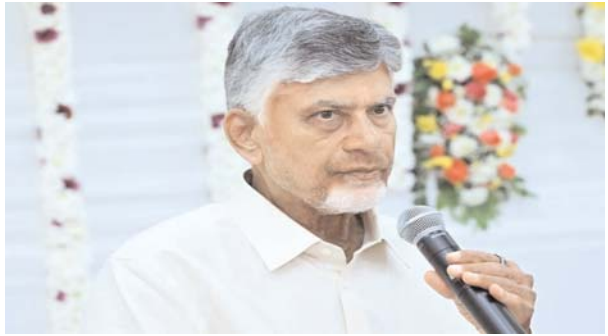
Chief Jagan Mohan Reddy on Amaravati. In a statement, Chandrababu Naidu criticised the YSRCP for allegedly misusing its own media platforms while resorting to baseless allegations and abusive rhetoric against independent media organisations. He noted that despite facing harassment and (Contd. page 2)

Amaravati, April 7 : Andhra Pradesh Chief Minister N. Chandrababu Naidu on Tuesday condemned the attempt by YSR Congress Party (YSRCP) workers to attack the office of a Telugu media outlet in Hyderabad.