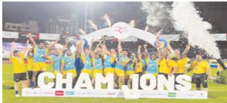
Rugby India on Monday

SOUTH CENTRAL RAILWAY Follow us on @SCRRailwayIndia Details of the Tender Notices of S.C. Railway can be seen on our website: www.scr.indianrailways.gov.in Open E-Tender Notice No. CAO/Con/RSP/SC/02/2026-Capital (Works) Deposit dated 01/04/2026 & 02/04/2026