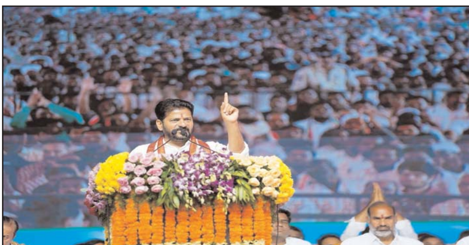
Telangana Chief Minister insisted he was unfazed. He also accused Vijayan of insulting the people of Kerala and declared that "his time is over", before signing off with a curt "bye bye Pinarayi". (Contd. page 2)

Thiruvananthapuram, April 7 : A sharp and unusually personal war of words between the Telangana Chief Minister A. Revanth Reddy and his Kerala counterpart Pinarayi Vijayan escalated on Tuesday, turning into a full-blown political slugfest that has drawn national attention.