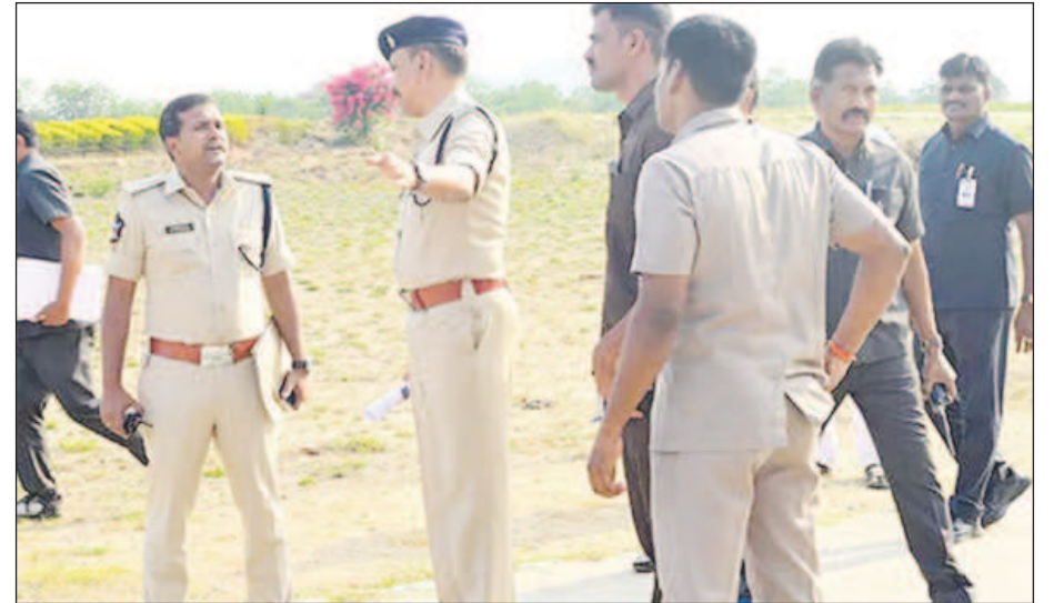
Sathyasa Sai District: Apr 6