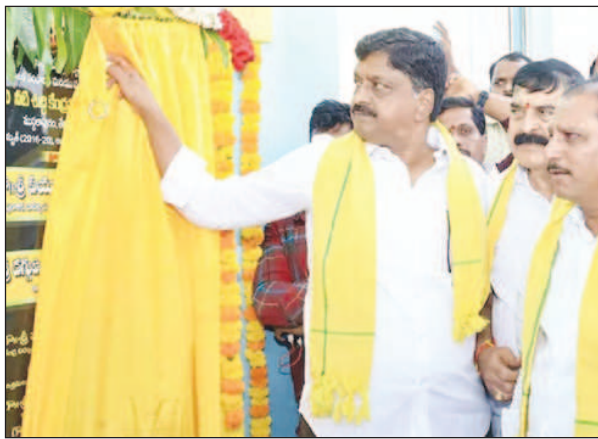
Anantapur: Apr 6

State Finance Minister Payyavula Keshav on Saturday inaugurated a newly constructed water treatment plant at Mudalapuram in Kuderu mandal of Uravakonda constituency. The facility has been developed under the supervision of the State Municipal Administration and Urban Development Department. Constructed at a cost of 15.35 crore under the Central Government-supported AMRUT scheme, the modern plant has a daily water purification capacity of 16 million litres. The initiative aims to ensure uninterrupted supply of safe drinking water, particularly in view of the approaching summer season. The state government has reiterated its commitment to preventing drinking water shortages in Anantapur district by strengthening infrastructure and ensuring consistent water availability. The new facility is expected to significantly benefit residents of Kuderu mandal by providing access to quality potable water. Officials stated that the project is part of broader efforts to address long-standing drinking water issues in the Uravakonda constituency. The minister's ongoing initiatives in this regard are reportedly yielding positive results. The inauguration ceremony was attended by Anantapur Member of Parliament Ambica Lakshminarayana, Anantapur Urban MLA Daggupati Prasad, government officials, local leaders, party workers, and residents.