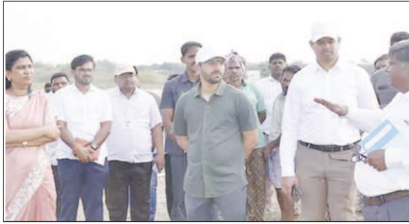
Anantapur: Apr 6

Extensive arrangements are being put in place for the visit of Andhra Pradesh Chief Minister N Chandrababu Naidu to Yadiki mandal in Anantapur district on April 6, officials said. District Collector O Anand directed officials to ensure that all preparations are completed without lapses.