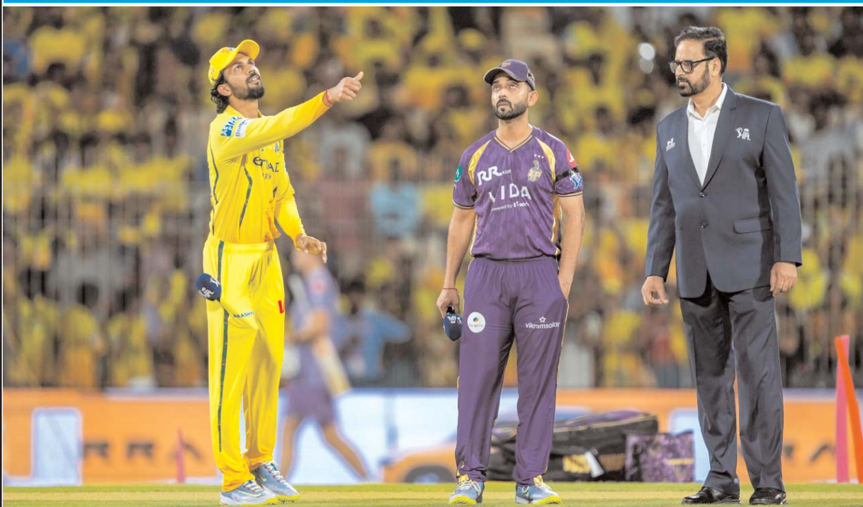
Chennai, April 14 : Kolkata Knight Riders (KKR) won the toss and elected to bowl against Chennai Super Kings (CSK) in the 22nd match of the Indian Premier League (IPL) 2026 at the MA Chidambaram Stadium in Chennai on Tuesday. This matchup is a crucial test for

both teams, who are both struggling at the bottom of the standings and desperately need points. CSK approach this home game with renewed confidence after breaking a three-match losing streak with a convincing 23-run victory over Delhi Capitals. The standout performance came