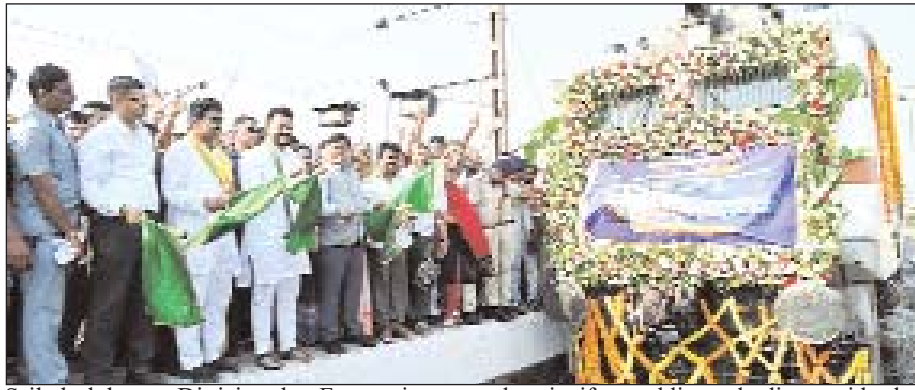
Srikakulam; Divisional Railway Manager Shri Lalit Bohra; District Collector Srikakulam Shri Swapnil Dinakar and other distinguished dignitaries. The introduction of Train No. 17440 Srikakulam Road - Tirupati Weekly Humsafar

By Skyline Staff Reporter Visakhapatnam, April 13 In a historic milestone aimed at enhancing passenger convenience and strengthening rail connectivity in the region, the Humsafar Express connecting Srikakulam Road to the world-renowned Hindu pilgrimage destination, Tirupati, was flagged off for the first time at Srikakulam Road Railway Station. The inaugural ceremony was graced by Shri K. Ram Mohan Naidu, Hon'ble Union Minister of Civil Aviation, Government of India, in the august presence of Shri K. Ravi Kumar, Hon'ble MLA of Amudalavalasa; Shri G Shankar Hon'ble MLA