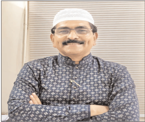
(By Our Staff Reporter) Guntur, Apr 13: