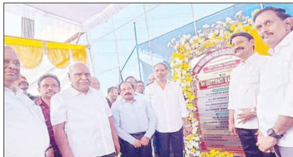
Vijayawada: Apr 9