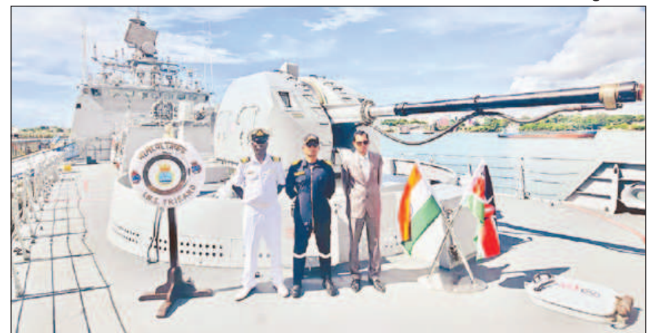
Visakhapatnam: Apr 9