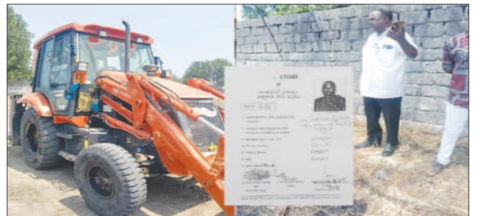
Kurnool: Apr 9