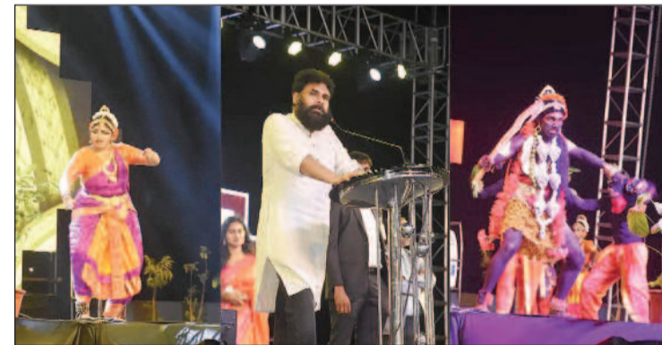
dance performances by university students left the audience spellbound. The excitement further increased with the presence of actor-turned-Deputy Chief Minister Pawan Kalyan as the

By Skyline Staff Reporter Visakhapatnam, April 9 Andhra Pradesh Deputy Chief Minister K. Pawan Kalyan on Wednesday called upon the youth to rise above community barriers and embrace a unified national ideology to drive the country's progress. An air of festivity pervaded the Andhra University Engineering College grounds as the valedictory of the three-day cultural fest, held on Wednesday evening (April 8), drew crowds in large numbers who thoroughly enjoyed themselves. Adding to the festive mood, the