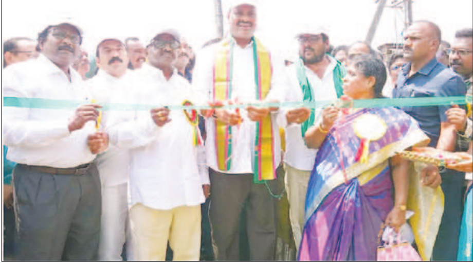
Rajamahendravaram: Apr 9

Agriculture minister K Atchannaidu called upon farmers to shift towards demand-based crop cultivation and adopt sustainable farming practices to improve incomes and protect soil health. Speaking at a Kisan Mela at the agricultural research station in Maruteru of Penumantra mandal in Achanta constituency of West Godavari district on Wednesday, the minister said organic farming offers higher returns with lower input costs while ensuring healthier food for consumers. The event focused on the theme 'Changing Climate Conditions-Sustainable Paddy Cultivation.'