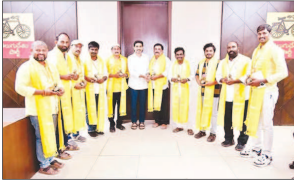
Vijayawada: Apr 9

Education and IT minister and TDP national general secretary Nara Lokesh on Wednesday expressed strong displeasure over the lack of organisational activity in recent weeks by some legislators.